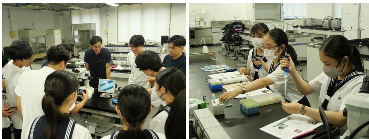
Gakushuin Boy’s Senior High School & Girls’ Senior High School students engaged in protein crystallization experiment

In partnership with the Japan Aerospace Exploration Agency (JAXA) and MARUWA Foods and Biosciences, Inc., Space BD is leading the search for crystallization conditions on Earth, space experiment conformity reviews, sample packing work, and other work. For this launch, in addition to approximately 50 total samples from the JAXA open call for academic projects, there are also protein samples from a crystallization experiment conducted by 15 high school students who participated in the “Protein Crystallization Experiment Workshop” held for Gakushuin Boys’ Senior High School and Girls’ Senior High School students. This workshop was conducted as one of the collaboration programs of the Industry-Academia Collaboration Agreement signed by Gakushuin University and Space BD in March 2022, and was planned for students in the Boys’ Senior High School and Girls’ Senior High School as part of the integrated education program provided by the Gakushuin University Faculty of Science. Once the samples are returned, an experiment is planned to compare the space experimental samples with the Earth experimental samples. Space BD also offers educational programs aimed at nurturing high school students' interest in space business and life sciences (in the area of drug discovery) by providing them with opportunities to be involved in space experiments.